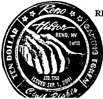
RENO HILTON #9 & #10