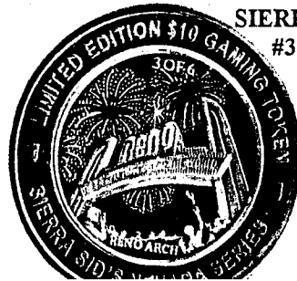
SIERRA SID'S #3 & #4