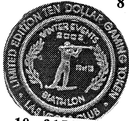
10 of 15 Biathlon