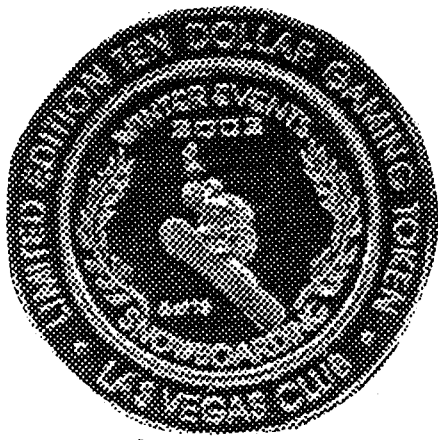
6 of 15 Snowboarding