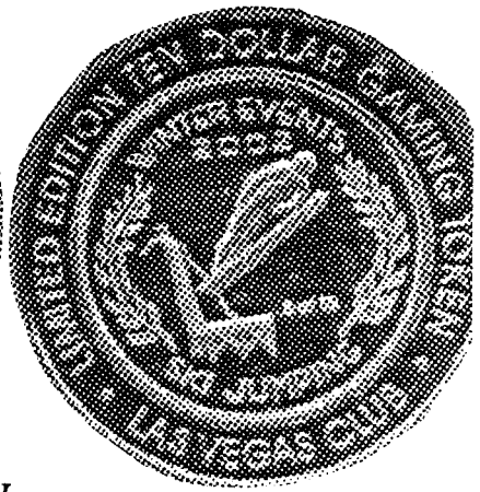
8 of 15 Ski Jumping