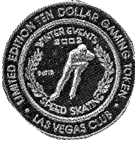
9 of 15 Speed Skating