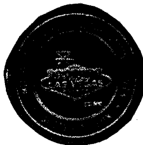
Slots A Fun $10 Pink Capsule