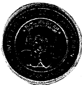
NY, NY Rita Rudner 2 nd Anniversary