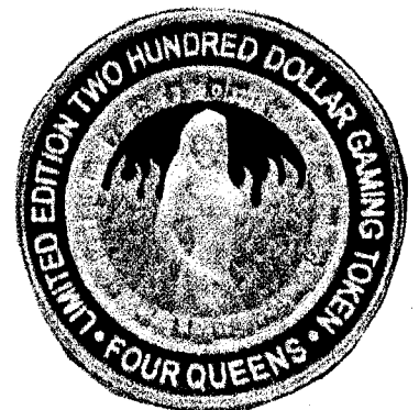
Four Queens $200 Roulette Girl? Elvira?