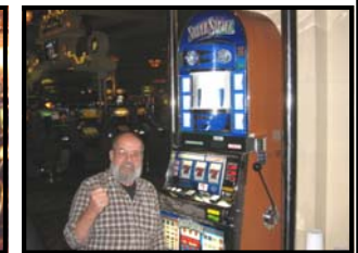
Frenchy showing how it is done...