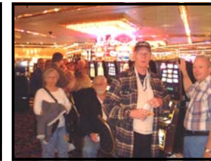
In line for the Hugo's $200...