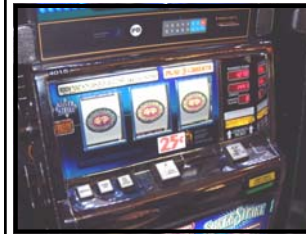
Here is what it looks like...