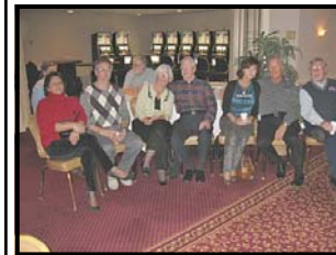
Patiently Waiting in Line....