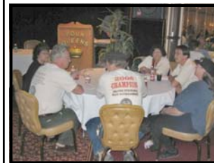
Table of Champions...