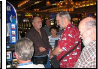
I'll make you a deal...