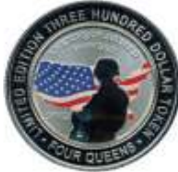
2 - Four Queens, America's Armed Forces 2012