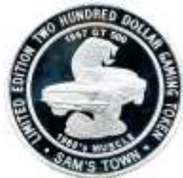
4 - Sam's Town 1967 GT 500