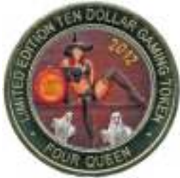
1 - Four Queens, Witch/ Pumpkin/ Ghost 2012