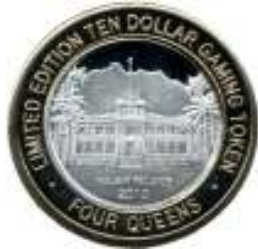
2 - Four Queens Iolani Palace 2010