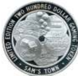
1- Sam's Town Casino Games