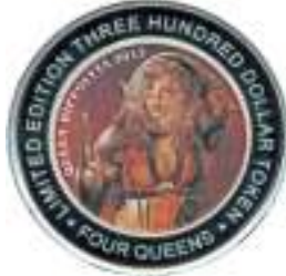
4 - Four Queens Queen Hippolyta 2012