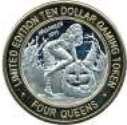
3 - Four Queens Girl/Pumpkin 2011